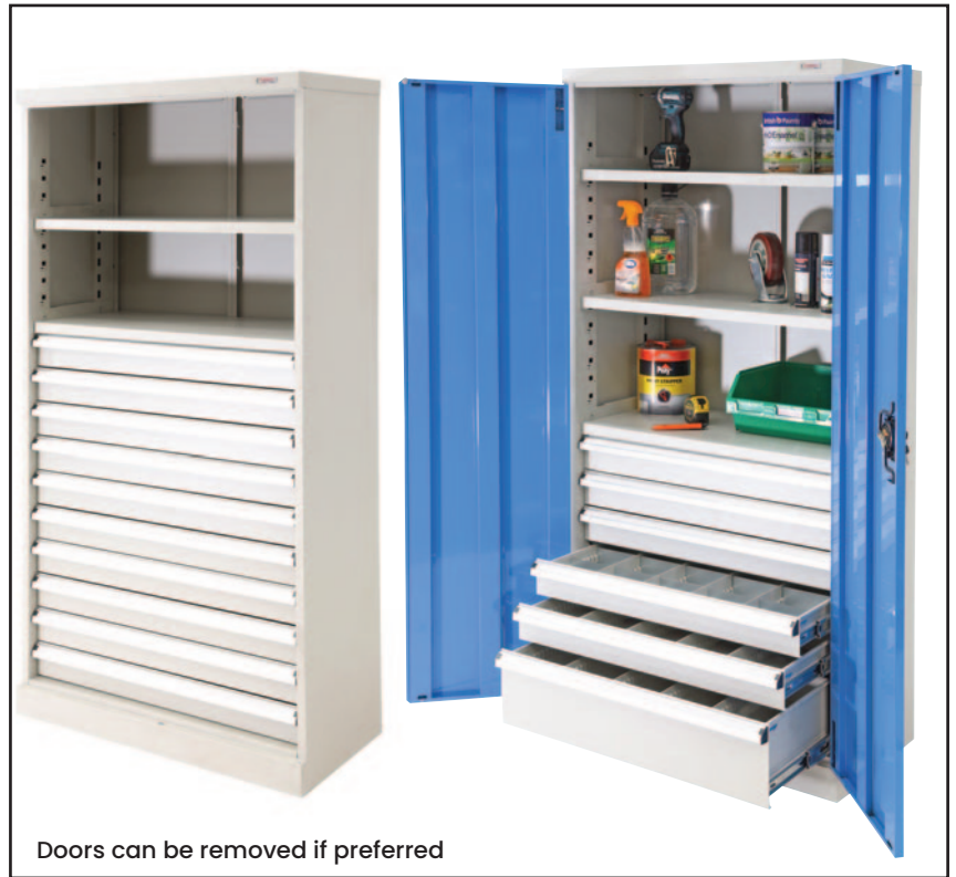
Doors can be removed if preferred