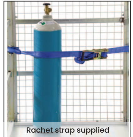
Ratchet strap supplied