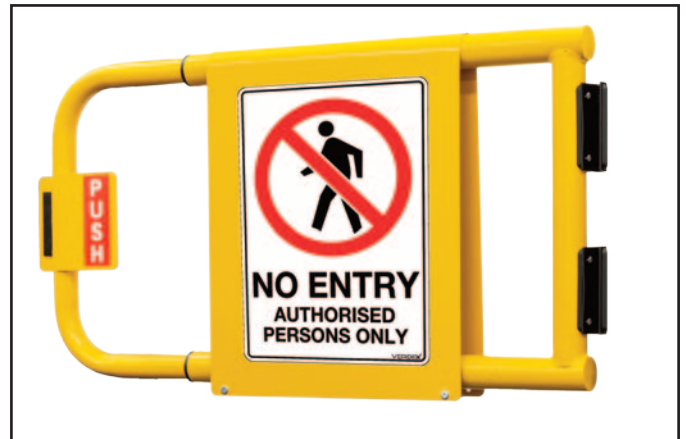
TR7477 pictured with safety signs