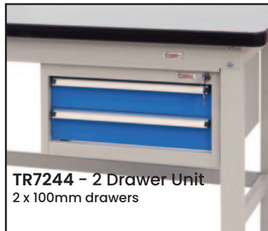
TR7244 - 2 Drawer Unit 2 x 100mm drawers