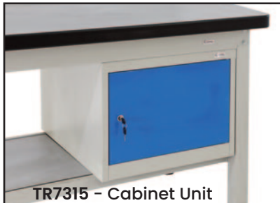
TR7315 - Cabinet Unit

Can be used flat or on angle as pictured