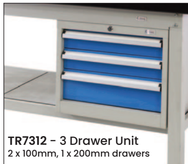
TR7312 - 3 Drawer Unit 2 x 100mm, 1 x 200mm drawers