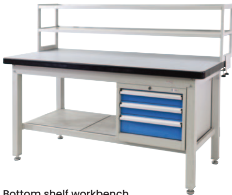
Bottom shelf workbench shown with 2 tier shelf (2100mm long)