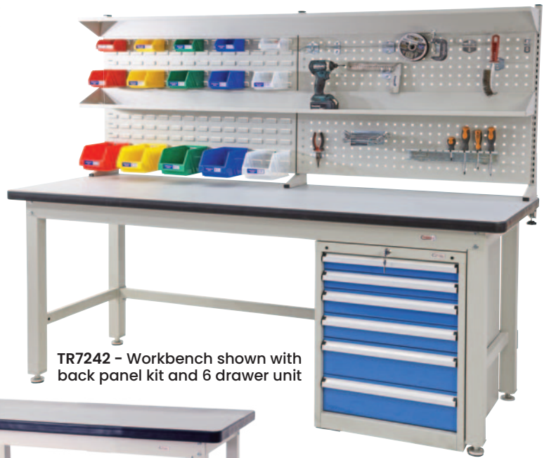
TR7242 – Workbench shown with back panel kit and 6 drawer unit