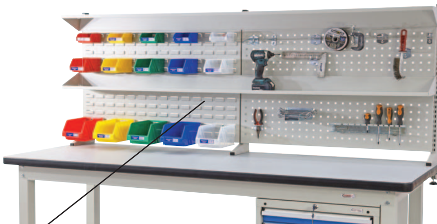
Back panel kit is supplied with both louvre panel and metal pegboard and 2 shelves