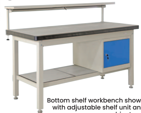
Bottom shelf workbench shown with adjustable shelf unit and cabinet unit