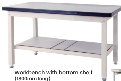
Workbench with bottom shelf (1800mm long)