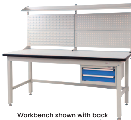
Workbench shown with back panel set and 2 drawer unit