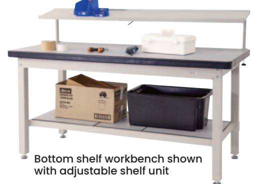
Bottom shelf workbench shown with adjustable shelf unit