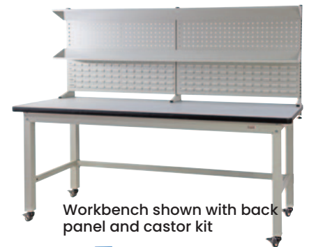
Workbench shown with back panel and castor kit