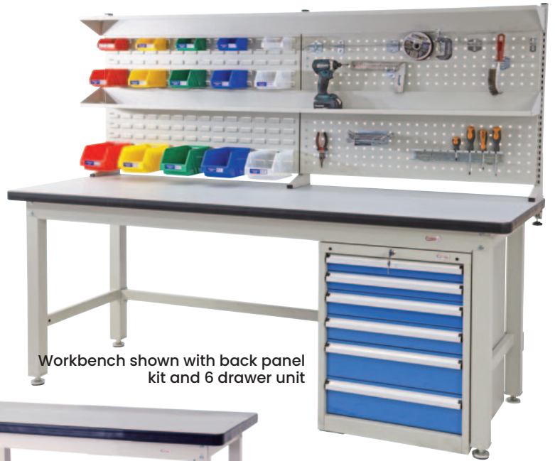
Workbench shown with back panel kit and 6 drawer unit