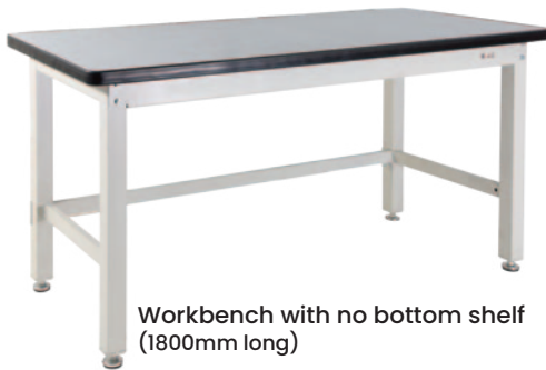
Workbench with no bottom shelf (1800mm long)