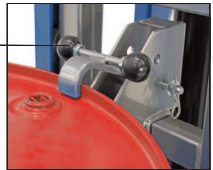
Spring loaded clamp to securely hold the drum