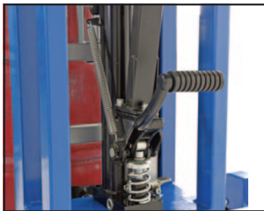
Foot pedal to raise drum