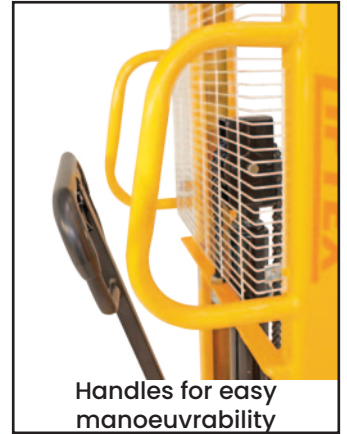
Handles for easy manoeuvrability