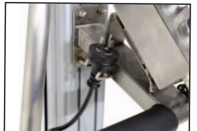
Built in charger