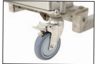
Quality rubber castors with rear brakes