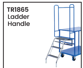
TR1865 Ladder Handle