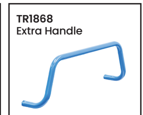
TR1868 Extra Handle