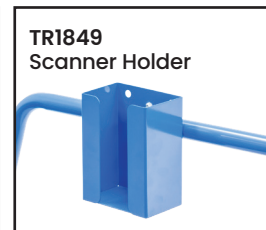
TR1849 Scanner Holder