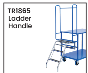
TR1865 Ladder Handle