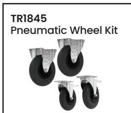
TR1845 Pneumatic Wheel Kit