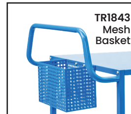
TR1843 Mesh Basket