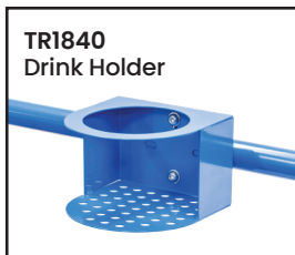
TR1840 Drink Holder