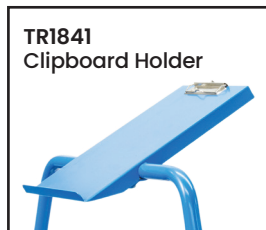
TR1841 Clipboard Holder