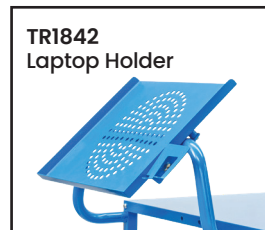
TR1842 Laptop Holder