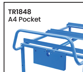
TR1848 A4 Pocket