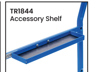
TR1844 Accessory Shelf