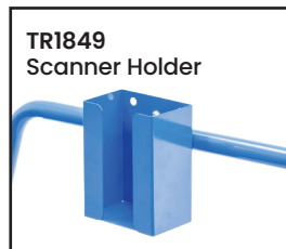
TR1849 Scanner Holder