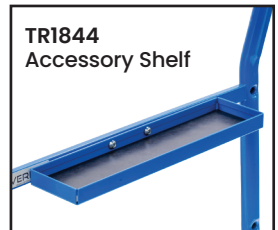
TR1844 Accessory Shelf