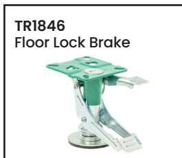
TR1846 Floor Lock Brake