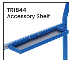
TR1844 Accessory Shelf