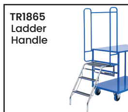
TR1865 Ladder Handle