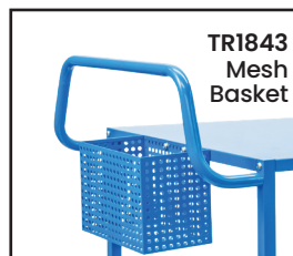
TR1843 Mesh Basket