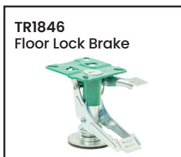
TR1846 Floor Lock Brake