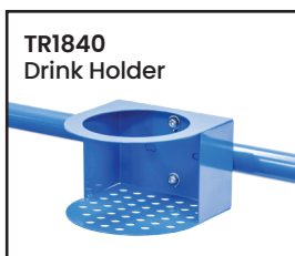
TR1840 Drink Holder