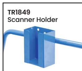
TR1849 Scanner Holder