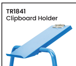
TR1841 Clipboard Holder