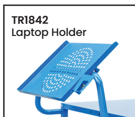
TR1842 Laptop Holder