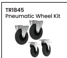
TR1845 Pneumatic Wheel Kit