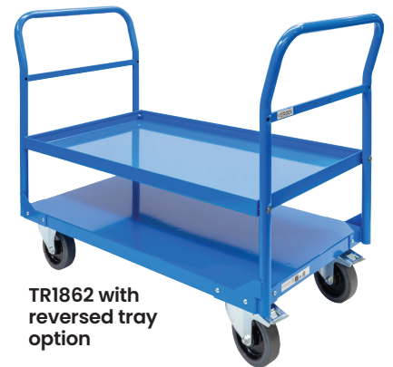
TR1862 with reversed tray option