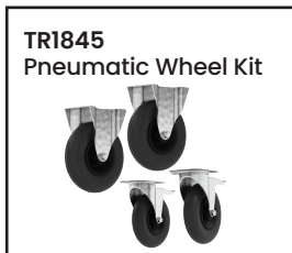
TR1845 Pneumatic Wheel Kit