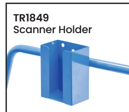
TR1849 Scanner Holder