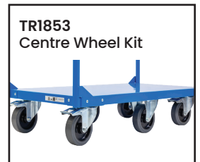
TR1853 Centre Wheel Kit