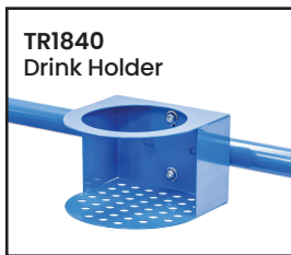
TR1840 Drink Holder