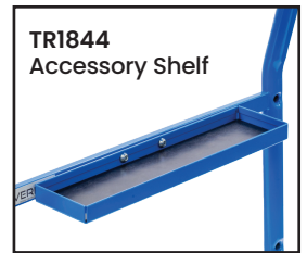
TR1844 Accessory Shelf