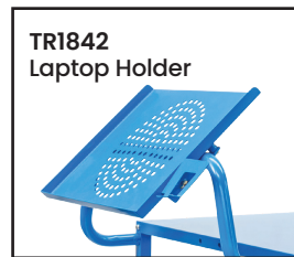
TR1842 Laptop Holder