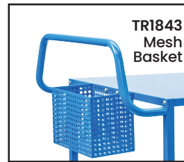
TR1843 Mesh Basket