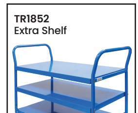
TR1852 Extra Shelf