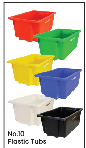
No.10 Plastic Tubs