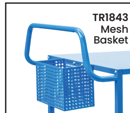
TR1843 Mesh Basket