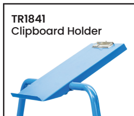
TR1841 Clipboard Holder