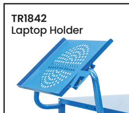
TR1842 Laptop Holder