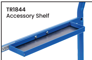
TR1844 Accessory Shelf