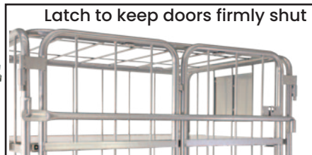
Latch to keep doors firmly shut