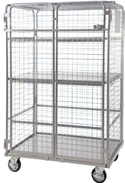
TR1136 with 2 shelves